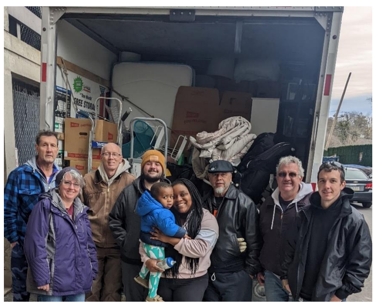
The Sisters of Life wanted to reach out and thank the Knights of Columbus for helping them relocate a young mom who decided to choose life. The Knights showed up in force and made short work of packing her entire apartment and unpacking it in the same day. Good job guys!

March 12th we can join the sisters for a rosary walk between 10:30 a.m. and 12:00 p.m. down in center City. If you can make this let me know so we can coordinate transportation.